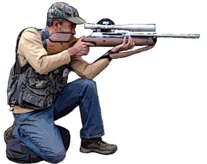
This is a typical allowed Kneeling position. NOTE: <u>WFTF Rules</u> allow only a kneeling roll for rear instep support.

A. An allowance for additional padding to fit between the thigh & the calf/foot can be requested from the Match Director prior to the start of a match. The pad cannot be larger than a legal-size kneeling roll. It will be at the Match Director's discretion to accept or deny any request.