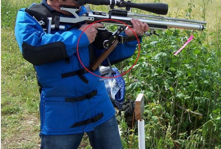
Not Allowed: Other than using a sling, the gun is to be supported solely by the hands, shoulder, and cheek.